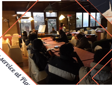
The service at Piano Torre