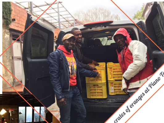
Unloading the crates of oranges at Piano Torre