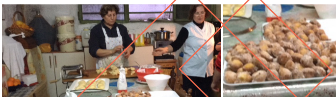
The ladies making the raviola and sfinge (donut balls)

As always: Let's go fishing (really) for one more.