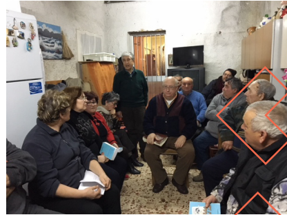
Some of the people for church service