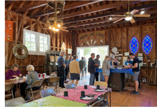
Breakfast to raise funds for the needy here on the island