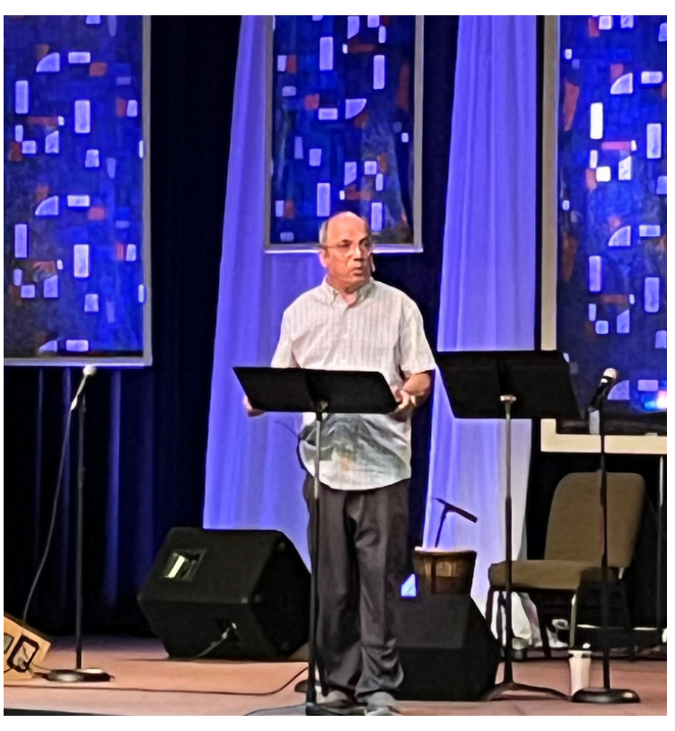
Preaching at Grace Chapel Waterford