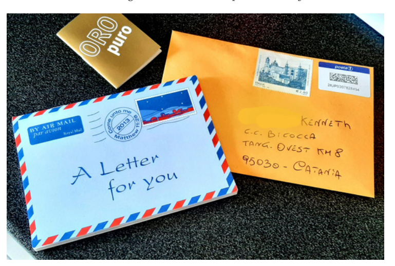
Some of the material for prison ministry that you supplied with your donations. Pray. Thankyou.