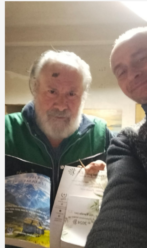
Receiving the word