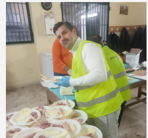
Helpers at dinner