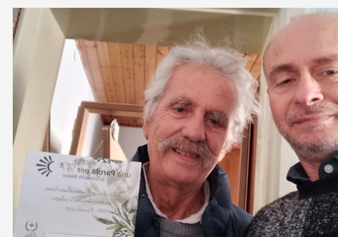
Receiving the word