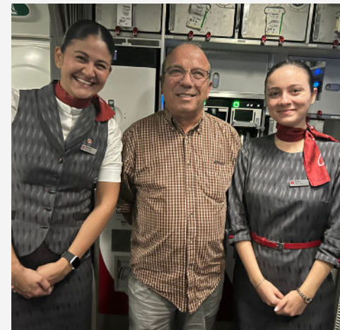
Sharing the gospel with the flight attendants at 38,000 feet in the air.