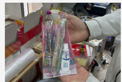
Packaged toothbrushes & toothpaste