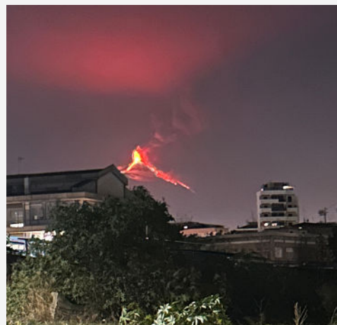
Mt.Etna waking up