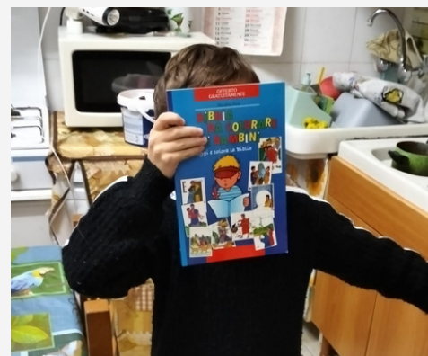
A child receiving and reading the word