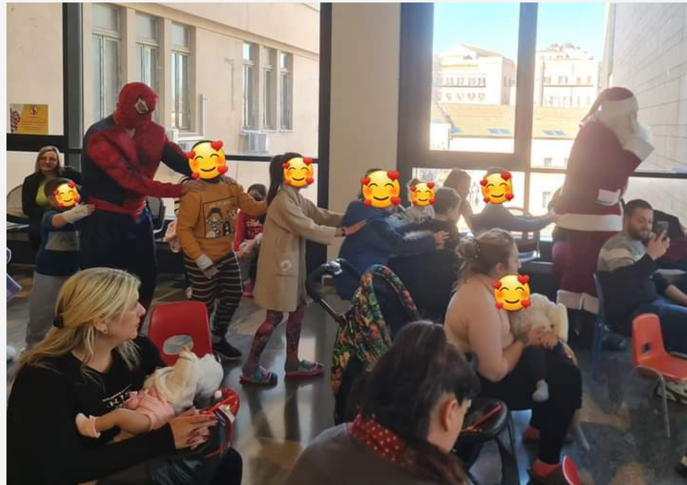
Some fun with the children at the hospital