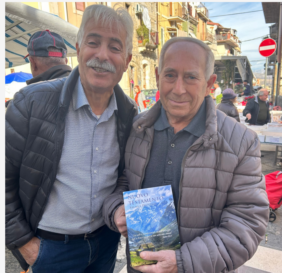
Receiving the word