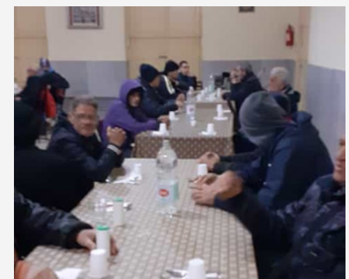
Feeding the homeless in Palermo